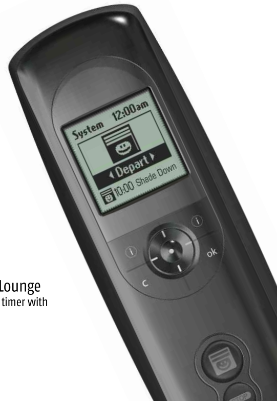
Impresario Chronis RTS Lounge (multi-channel programmable timer with on-screen display)

RTS controls offer a wide variety of functions for setting window coverings in motion, from anywhere in the home. Take control with multi-channel handheld remotes, programmable timers and wireless wall switches.